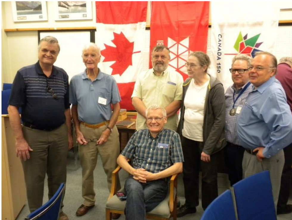
Bramalea Stamp Club Members