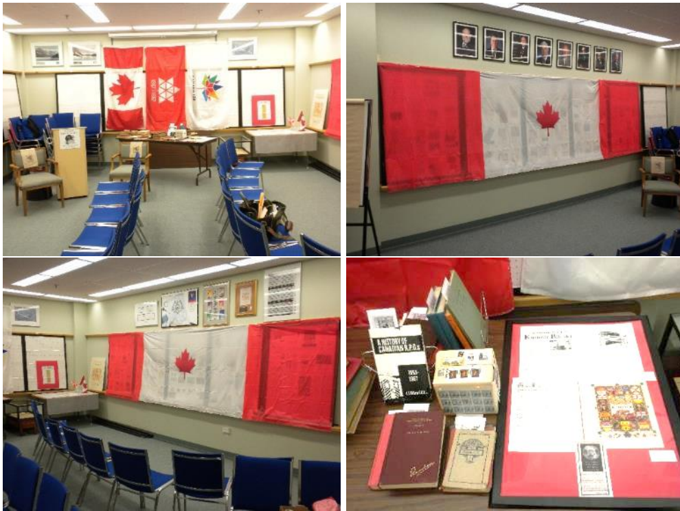
The pages hidden behind flags and a table of related ephemera.